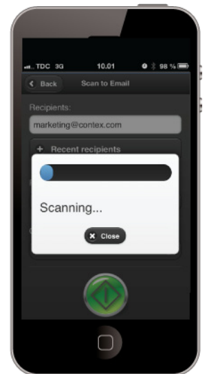
PageDrop handles the rest