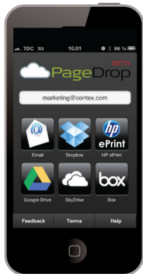
Scan the QR code

PageDrop includes a new pending patent that ensures a secure method for QR codes and Web Interfaces. PageDrop will only allow you to scan if you are in front of the scanner.